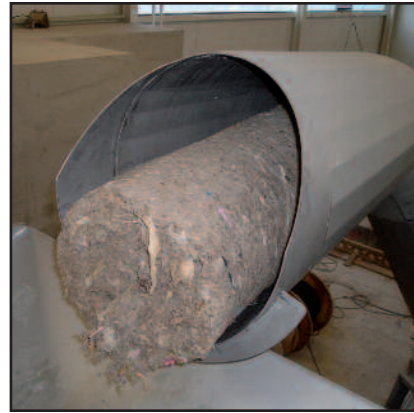
The FSM screening washing press

... is synonymous with hygienic and efficient handling of screenings. Waste disposal is a cost factor at every installation – wet screenings are heavy screenings and increase your costs. The septage in the water must be delivered to the subsequent sewage purification processes. The FSM screening washing press reduces the weight and volume of your screenings and in addition washes out more than 95% of fecal matter. FSM screening washing press provide high performance coupled with low operating costs.